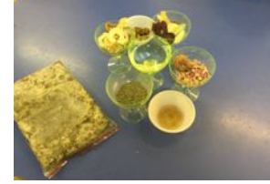
DIFFERENT WAYS TO PRESERVE FRUITS AND VEGGIES