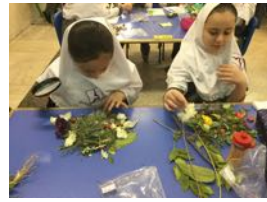
CLASSIFYING DIFFERENT PARTS OF PLANTS