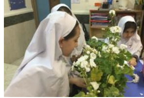
GERANIUM POT PROJECT